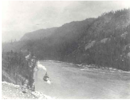
One of the last sternwheelers to ply the Columbia River at Trail in the early 1900s

The plans to construct the Columbia River Heritage & Science Centre on the Esplanade, which will house a new museum and archives, has progressed a little since the last newsletter, although not as quickly as hoped for. The project steering committee made a presentation to City Council on March 26 th to present our consultant's analysis of the merits of the project. We were well received and Council is in support of proceeding to the next phase, to prepare a detailed project concept plan that will include a cost estimate for the interior design of the facility and the costs of creating the exhibits.