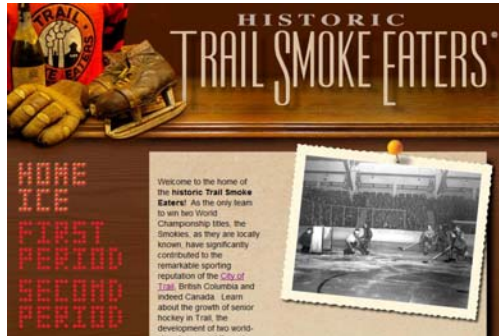
Homepage of the Historic Trail Smoke Eaters website.

Our panoramic digitization project has been funded by the UBC Librray and Teck Metals Ltd., and will see the digitization of our panoramic photograph collection