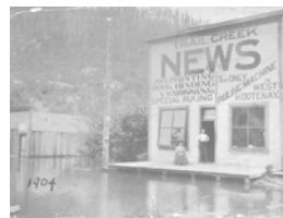
Trail Creek News office on Bay Avenue during high water in 1904

We have submitted three articles thus far, which included a story on our most recent journal, the 1962 Allan Cup winning Trail Smoke Eaters, and the 100th anniversary of